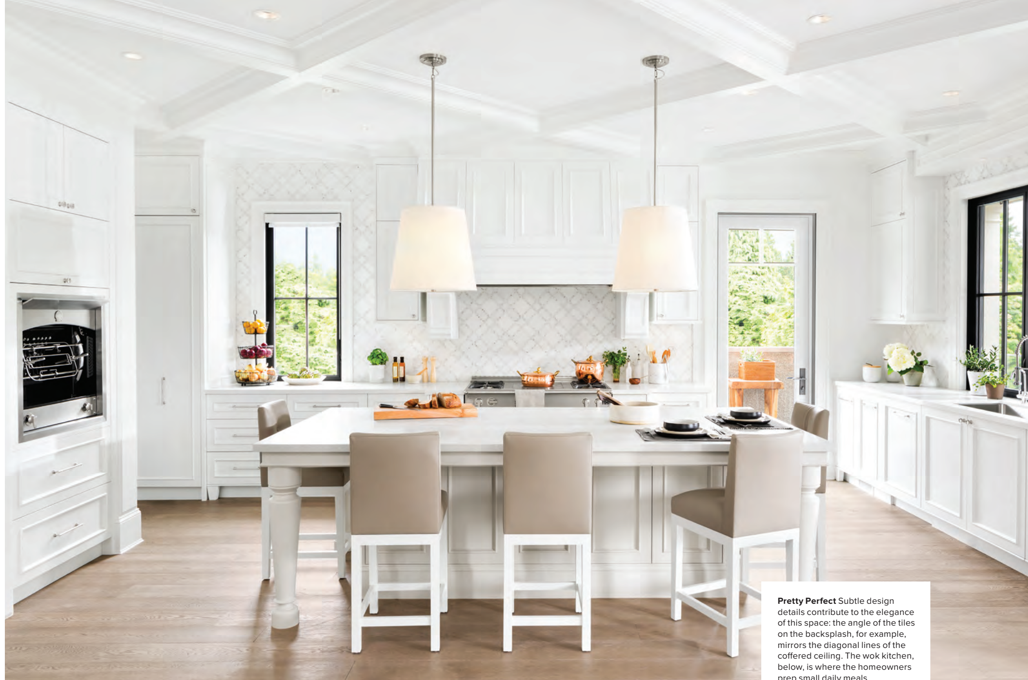
Pretty Perfect Subtle design details contribute to the elegance of this space: the angle of the tiles on the backsplash, for example, mirrors the diagonal lines of the coffered ceiling. The wok kitchen, below, is where the homeowners prep small daily meals.