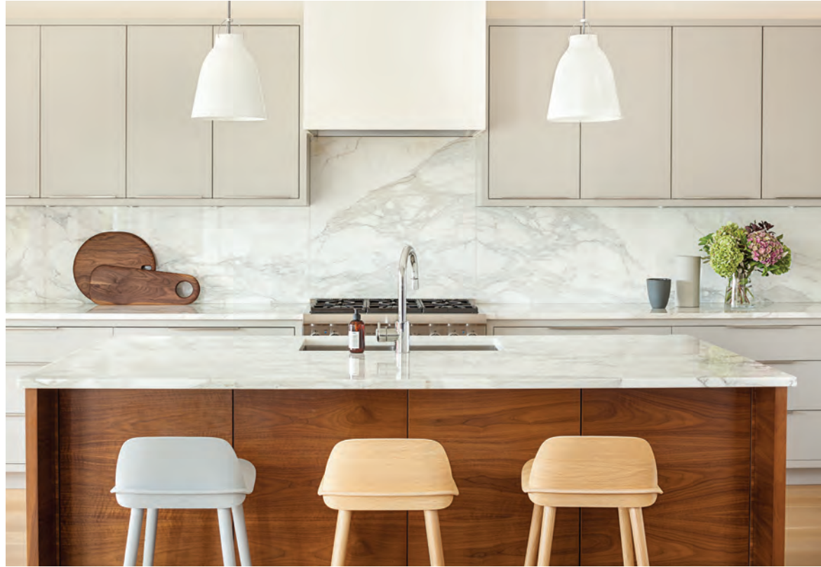
Simplify materials to enhance fine details. For this kitchen in Vancouver's Dunbar neighbourhood, designer Sophie Burke chose monastically quiet elements to allow subtle variations in the polished Calacatta marble backsplash to shine. The walnut island was stained a darker-than-natural hue to prevent orange undertones from developing over time and to contrast with millwork painted a barely there grey (Para Paint's Sing Time). "We wanted a colour that isn't obviously grey but has a natural stonewashed shade to it and picks up on some of the colours in the marble," says Burke. "It added interest without being too busy."